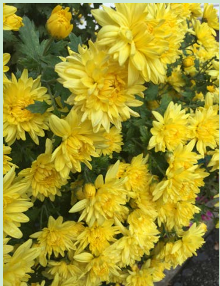
Yellow mums offer a sunshine welcome.